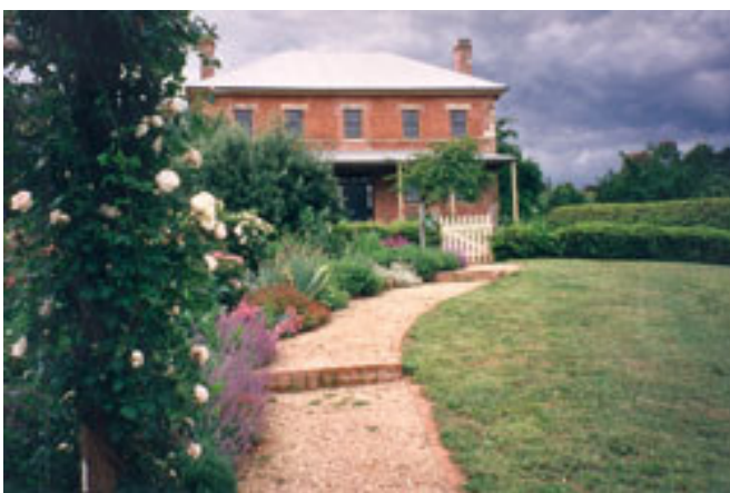
Harper's Mansion gardens in autumn.

Harpers Mansion is the closest other National Trust property to Wirrimbirra and it is important that we support one another wherever possible.