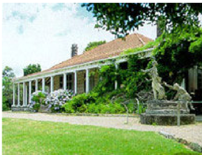
Falconbridge, via Springwood, Blue Mountains, home of Norman Lindsay (1879-1969), one of Australia's most controversial, exceptional and prolific artists.

Contact details: Phone: (02) 4751 1067 Email: info@normanlindsay.com.au